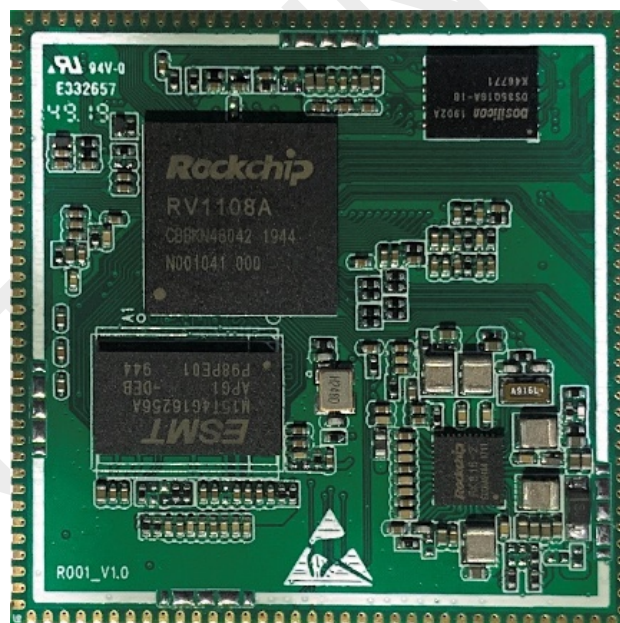
RK1108HX core board

RK1108HX core board is applicable to industrial control, power, communication, medical treatment, media, security, vehicle, finance, consumer electronics, handheld equipment, game machine, display control, teaching instrument, POS, multimedia terminal, PDA, ordering machine, advertising machine etc.